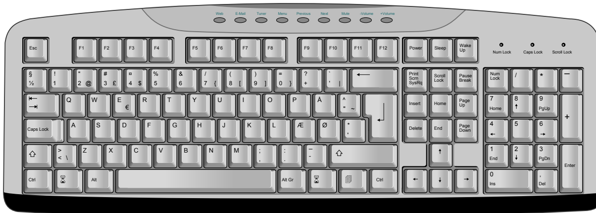
Figure 2: This figure floats to the top of the page, spanning both columns.